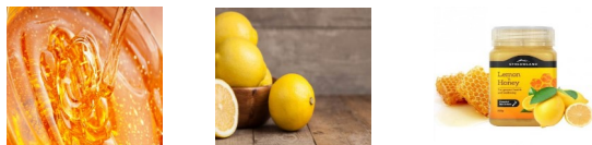
Honey + Lemon= Lemon Flavoured Honey

There are many value added products that can be made locally that include fruits. Mangoes, pineapples-