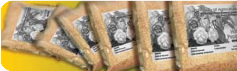
Plate 4. Good quality packaged Scotch Bonnet pepper seeds

Fourteen to 28 g ( 1/2 - 1 oz) of seeds are required to plant out a 0.4 ha (1 acre) field. Twenty-eight grams (1oz) of seeds contain approximately 5500 - 6000 seeds. Place soil into cells with one seed in each cell, 0.5 cm (roughly 1/4 in.) deep. Use more soil to cover the seeds lightly. Trays should then be watered and allowed to drain.