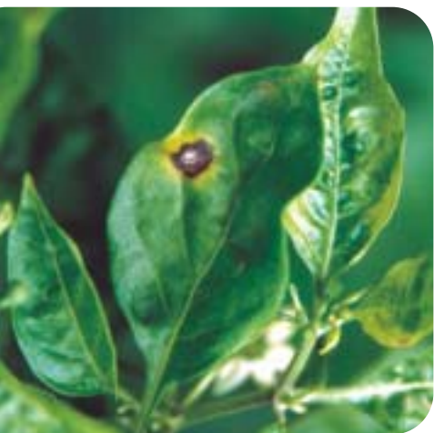
Plate 34. Frogeye spot - leaf

A fungus causes this disease. It produces spots that are round, whitish, grey or brown, often with brown or reddish brown borders. Infected leaves fall off early. The fungus also attacks the stem. The severity of the attack sometimes varies. Where conditions are suitable, crop damage may be serious. The fungus is carried on seeds; hence, care should be taken to select clean seeds for plant