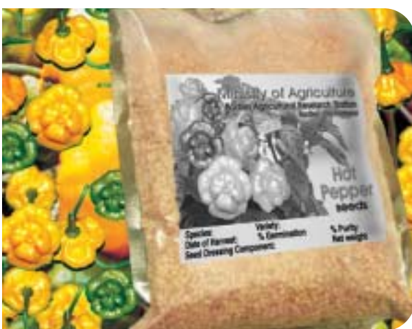
Plate 1. Properly labeled seed package

Seeds bought from farm stores, are not always guaranteed to be of good quality. Farmers should only buy seed packages which are clearly labeled, detailing species, variety, date of harvesting, percentage germination, percentage purity, seed treatment, net weight and producer's name.