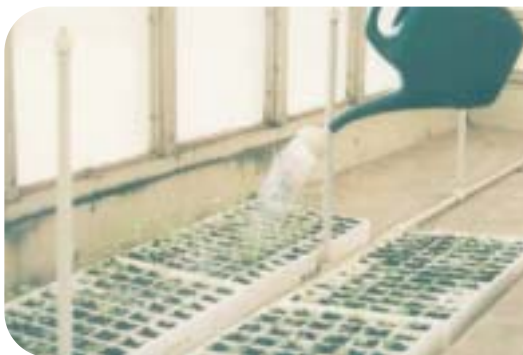
Plate 5. Applying foliar fertilizer

Several commercial foliar fertilizer mixes are available, but a 20-20-20 mix is best. This contains the three main plant foods, nitrogen (N), phosphorus (P) and potassium (K), in equal portions.