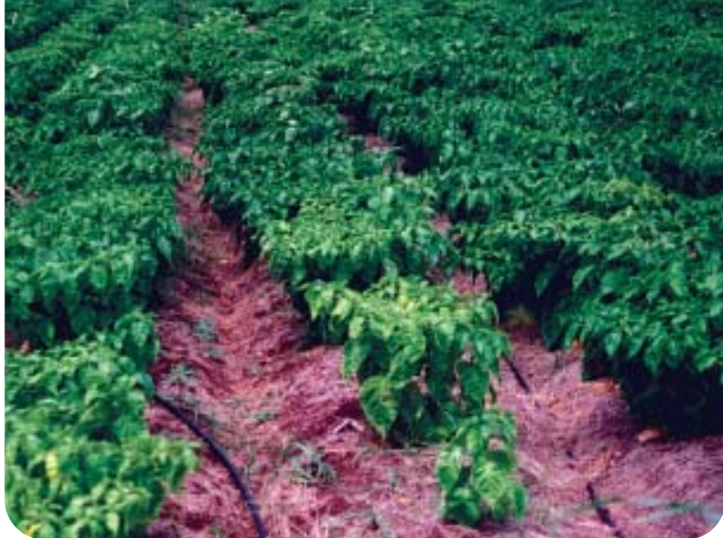
Plate 14. Scotch Bonnet pepper on Grass mulch

Hand weeding may still be necessary, especially between the pepper rows. Carefully remove these weeds with a machete or hoe.