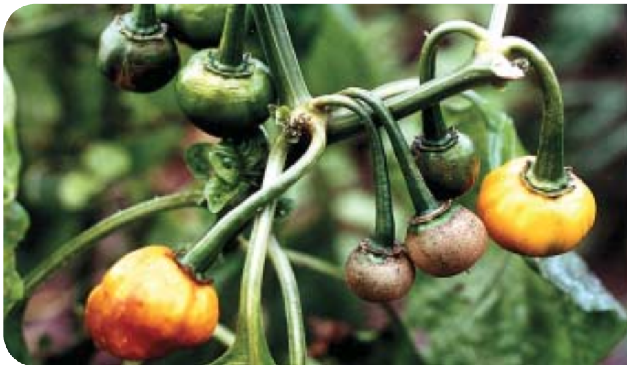
Plate 18. Broad mite damage on fruits

Mites will cause leaf deformation and curling. Affected leaves may appear rusty (bronze/brownish), especially on their lower surface. These will be smaller in size and will eventually fall off. If there is severe broad mite infestation, the entire plant will become stunted; flowers will fall off and fruits will be small, deformed and discoloured (rusty). Broad mite leaf damage is sometimes mistaken for virus damage. If in doubt, seek the assistance of your extension officer or plant protection specialist.