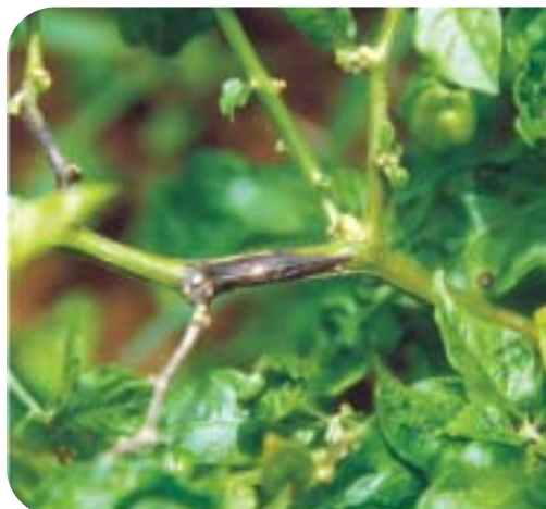
Plate 35. Frogeye spot - stem