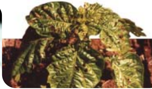
Plate 24. Cucumber beetle damage on plant