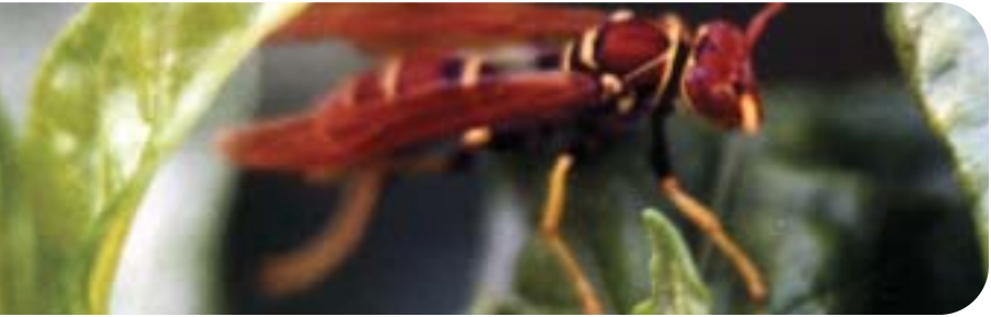
Plate 26. Natural enemy, the paper wasp

The pepper budworm is the caterpillar stage of the bud moth. This is a very small moth, which lays its eggs on the leaves of pepper plants during flowering. When the eggs hatch, the young budworm crawls into the unopened flower and feeds on the inside, causing it to fall off. Although some flowers fall off naturally, the budworm causes greater flower loss. Fewer flowers on the tree, cause less fruits to develop, and result in reduced yields and income for the farmer.