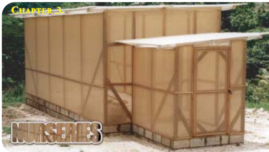
Plate 2. An insect-proof screen house