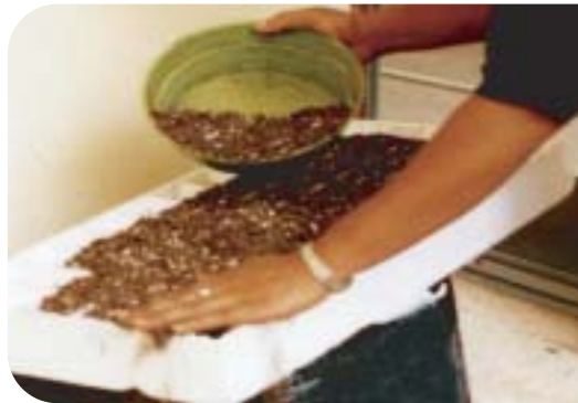
Plate 3. Filling trays with potting soil

Approximately 450 g (1 lb.) potting soil is needed per seedling tray. Good potting soil is loose, allowing for good drainage, aeration and good root growth, and may also provide some plant food.