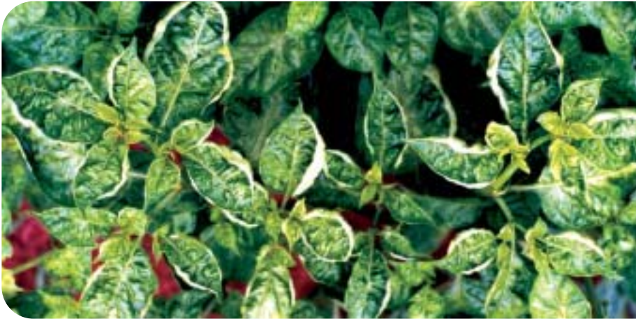
Plate 28. Plant infected with TEV

As was outlined earlier, aphids spread these viruses.