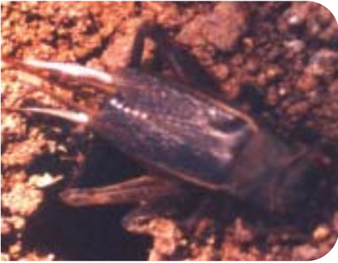
Plate 20. Field cricket

These insects damage pepper plants mainly at the seedling stage and soon after transplanting. Field crickets, or "pull-pull", as they are commonly called, resemble small grasshoppers, but are dark, fairly large and primarily do damage at nights. During the daytime, they live in holes (nests) in the ground near to the young plants, which they prey on at nights and store underground.