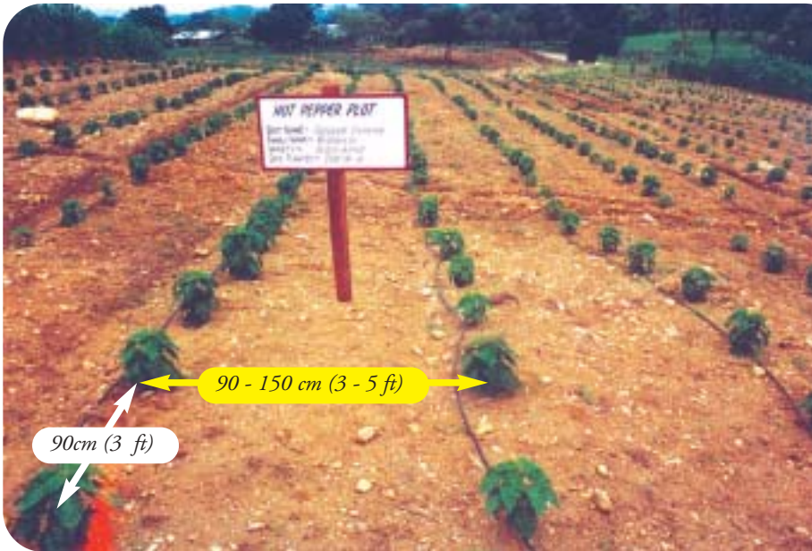
Plate 10. Recommended planting distance

Spacing is very important to Scotch Bonnet pepper growth. Proper spacing will ensure maximum use of the land without overcrowding. Rows may be spaced 90 – 150 cm (3 - 5 ft) apart, with plants along the row at 90 cm (3 ft). For high density planting, rows 90 cm (3 ft) apart with plants 90 cm (3 ft) apart, is recommended, but only at low elevations.