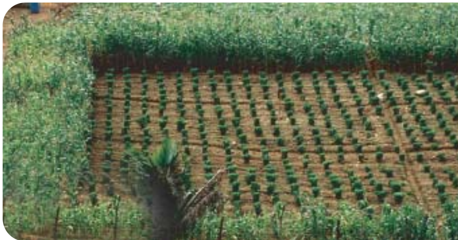
Plate 29. Scotch Bonnet pepper with corn as barrier crop