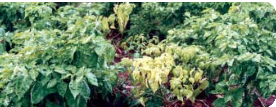
Plate 30. Fusarium wilt - showing yellowing of leaves

Fusarium wilt is caused by a fungus, which is present in the soil. Where the soil is allowed to dry out or is overwatered, the fungus develops rapidly. When plants suffer from water stress they are more readily affected by the disease.