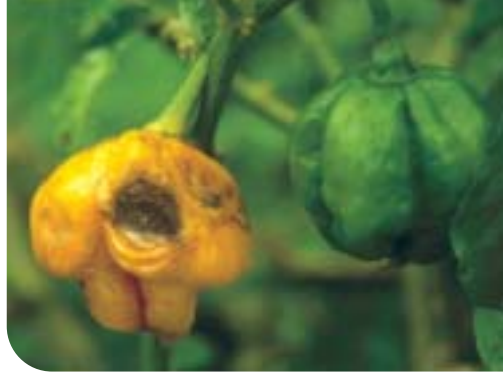
Plate 32. Anthracnose - fruit

When plants die from Sclerotium wilt, the whole plant and the soil around the root area should be carefully removed and burned outside of the field. Deep ploughing will also bury the fungus below the surface layer, away from the plant root. (see Appendix 2)