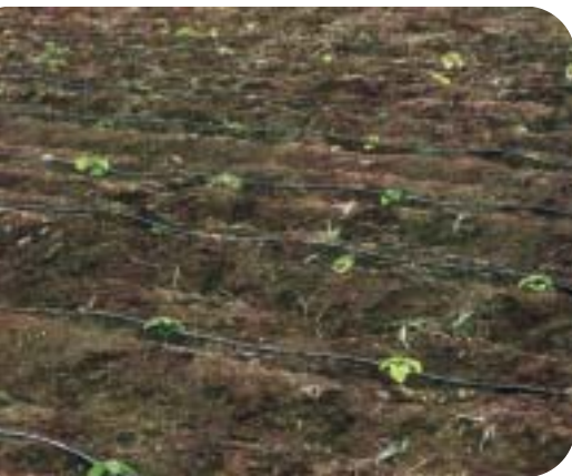
Plate 13. Drip irrigation

Irrigation is necessary to produce a good crop. The main types of irrigation are sprinkler, drip and furrow.