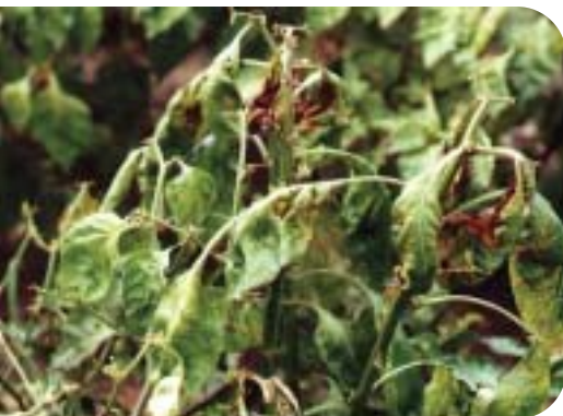
Plate 17. Broad mite damage

broad mite has eight legs, while insects have six. The mite may be carried from one plant to another, or from field to field by the wind, by insects, or even by people and animals. You can tell when the broad mite is present in the field, by the damage it does to the plants.