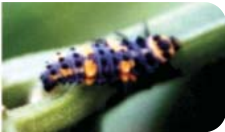
Plate 27. Natural enemy, young ladybird beetle

In addition to predatory insect pests attacking the pepper crop, there are a number of other insects and mites, which cause no damage. These are "friendly", and are regarded as "natural enemies" and should, therefore, be encouraged and protected where possible. The paper wasps "brown gal", feed their young with small caterpillars; some very small wasps lay their eggs and develop inside caterpillars; spiders feed on various insects; "assassin" bugs suck the juice of caterpillars and other bugs such as ladybird beetles and lacewing. Some fly maggots also feed on aphids and small soft-bodied insects; while predatory mites feed on plant mites.