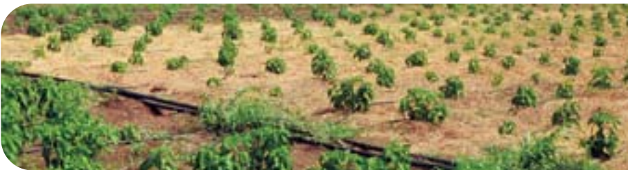
Plate 9. Well established Scotch Bonnet pepper field after transplanting