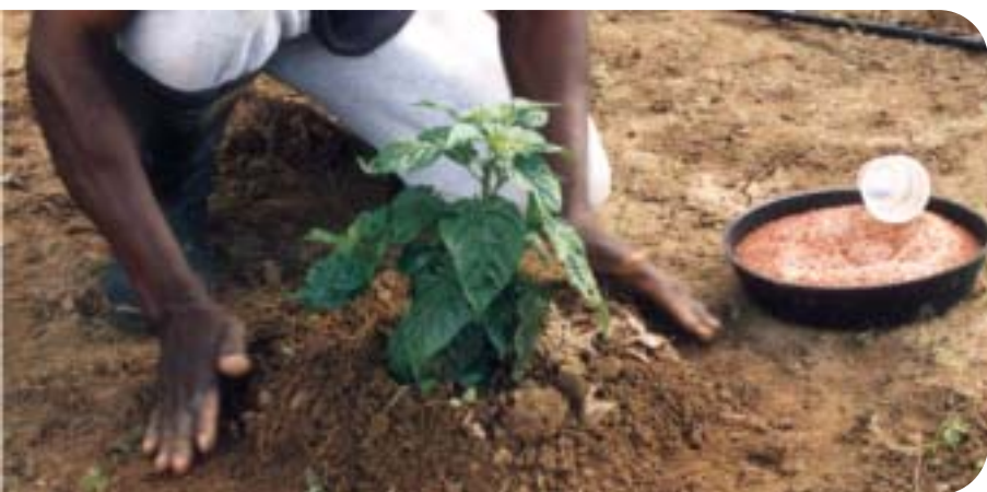
Plate 12. Covering fertilizer