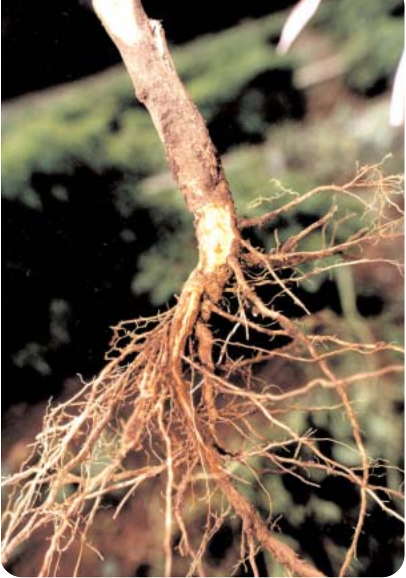
Plate 31. Fusarium wilt, root damage

The disease can be carried from the nursery into the field on the roots of seedlings. diseased plants in the field become yellow, weak and die slowly. Fusarium wilt is confirmed when the tissue under the bark of the stem appears reddish-brown in colour. This indicates the presence of the fungus blocking the vessels (tubes) in the plant that carry water upwards to the leaves.