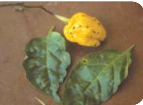
Plate 33. Bacterial spot - leaf and fruit

The fungus is carried from one crop to another on diseased plants. This makes it necessary to remove and burn all plants and fruits from old fields. Where possible, rotation should be practiced with resistant crops. The fungus also affects the seeds, so farmers should obtain clean, good quality seeds when establishing new nurseries, instead of using seeds from their old crops. Prompt and thorough harvesting of mature fruits also reduces the build up of the disease in the crop.