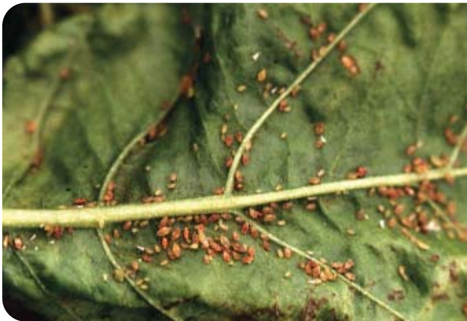
Plate16. Aphids on pepper leaf

Aphids (commonly called plant lice) are small insects that are readily seen. They vary in colour from yellowish green to dark green, and are mostly found feeding on the underside of pepper leaves. Aphids pierce plant tissue and suck the sap. This weakens the plant and may cause leaves and twigs to become deformed.