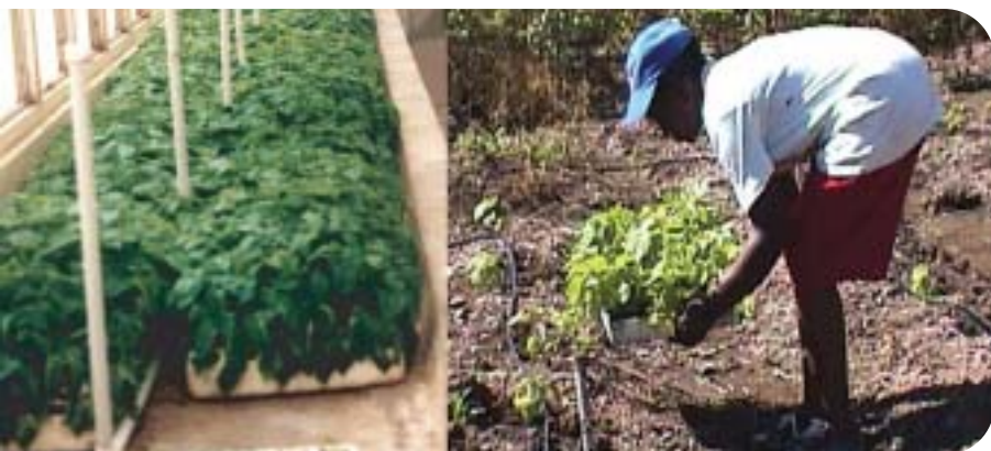
Plate 6. Seedlings ready for transplanting

The seedlings should be ready for transplanting after five to six (5 - 6) weeks, when they should be about 12 - 15 cm (5 - 6 in) in height .