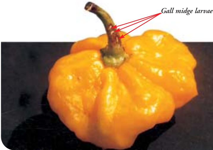
Plate 19. Gall midge damage on ripe Scotch Bonnet