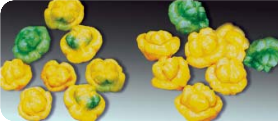
Plate 36. Scotch bonnet pepper showing 3 and 4 lobes and bonnet.

Grade A peppers will tolerate some degree of bruising (about 5%). Eight percent (8%) of bruising is tolerated in peppers that are of Grade B quality.