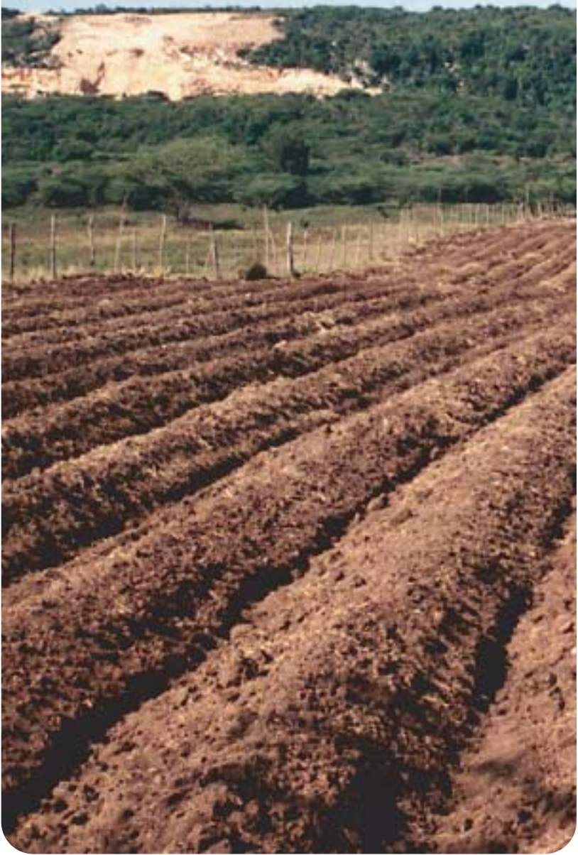
Plate 7. Land with heavy clay prepared for receiving Scotch Bonnet transplants.

Plant a barrier crop at this time (see section on aphids control). Once the barrier crop is 45 - 60 cm (18 - 24 in.) high, seedlings may be transplanted. If grass or plastic mulch is used, place in the field before seedlings are transplanted.