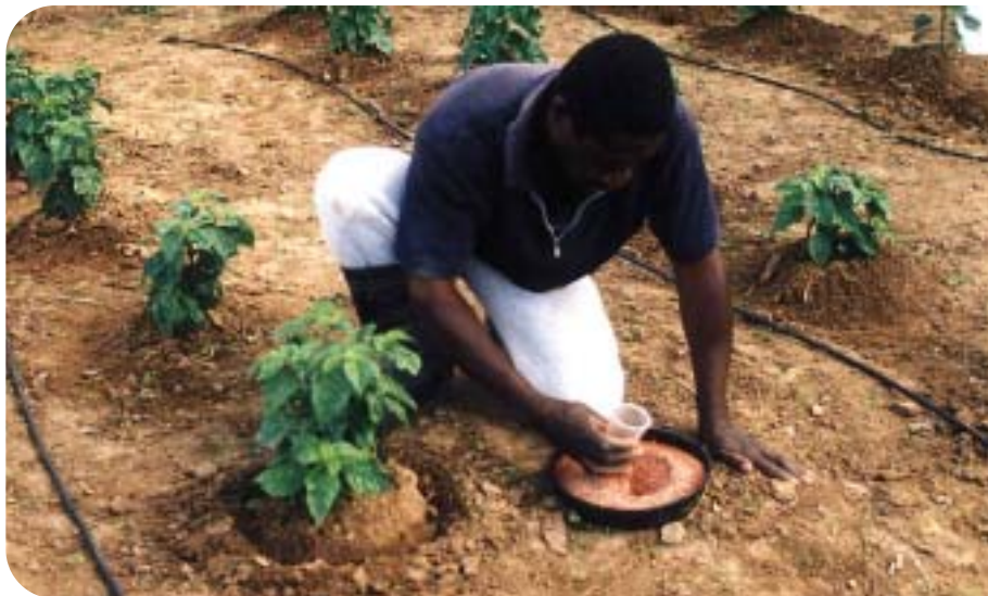
Plate 11. Circular banding of fertilizer