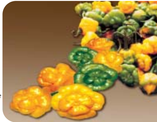
Plate 37. Grade "A" Scotch Bonnet peppers

Everything else is considered to be "reject quality" fruit. Rejected fruits include all those that are undersized, bruised, split or broken; decaying, insect infested, immature or over-ripe. The shape of fruits also sometimes causes rejection. Mouldy or rotten fruits are not acceptable.