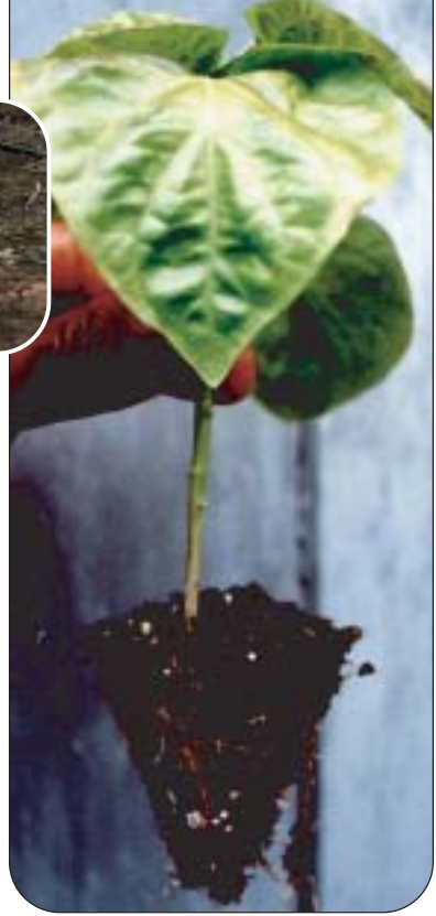
Plate 8. Healthy seedling showing a good "root ball"

Water seedlings before they are removed from the trays. This makes it easier to take out each plant without damaging it.