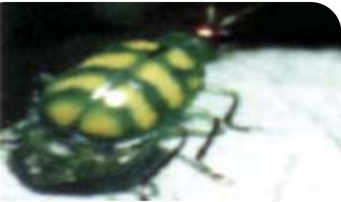
Plate 23. Yellow-banded cucumber beetle

The green, yellow-banded cucumber beetle can be a serious problem in the early stages of the pepper crop. These small beetles cut holes in the leaves (like bullet holes). Where large numbers develop and feed on plants, growth is retarded.