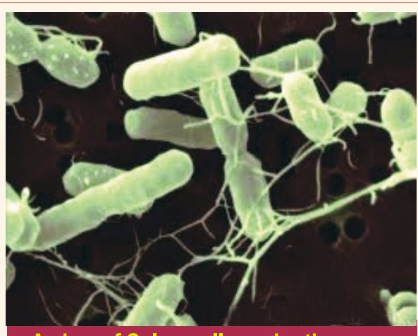
A view of Salmonella under the microscope

All ages of pigs are susceptible, but the disease is most common in weaned and growing-finishing pigs. Pigs at highest risk of disease are usually under stressful conditions, such as inadequate feed or water, transportation, drought, overcrowding birthing and some drugs.