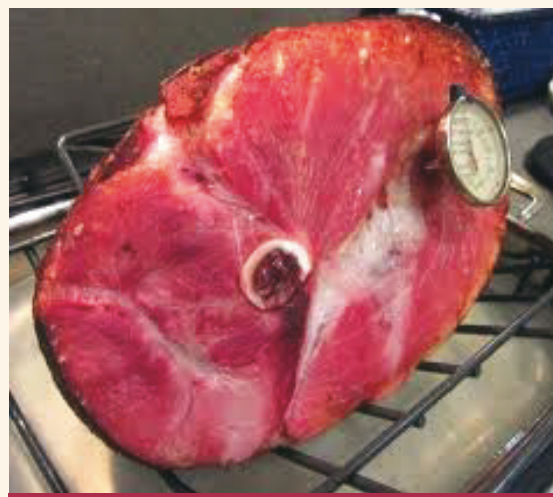
Ensure that pork is properly cooked before eating.