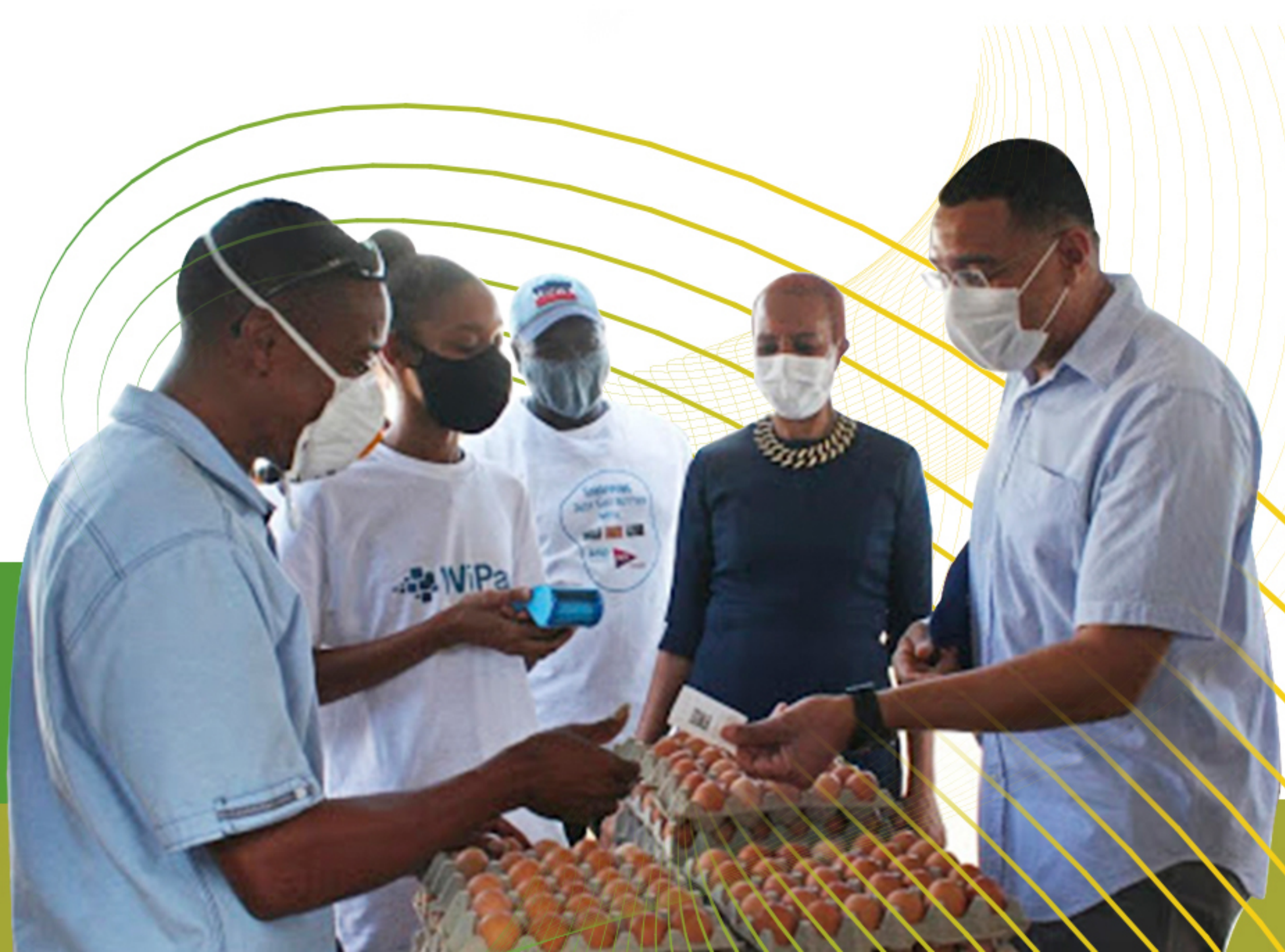
Prime Minister Andrew Holness(right) purchasing eggs at Cashless Farmers' Market in St. Andrew while the Hon Fayval Williams (2nd right) looks on.

To date the programme has impacted over 3,000 farmers directly and over 40,000 farm families indirectly moving in excess of 2.5 million kilogrammes of produce. The initiative achieved its goals of providing a secure and fair market for many of our farmers and brought affordable and fresh quality produce to Jamaicans through our Say Yes To Fresh Campaign. Parallel to sustaining income generation for our farming community, our farmers in collaboration with the Ministry supported quarantined communities and institutions through direct contributions of free produce valuing approximately $16 million.