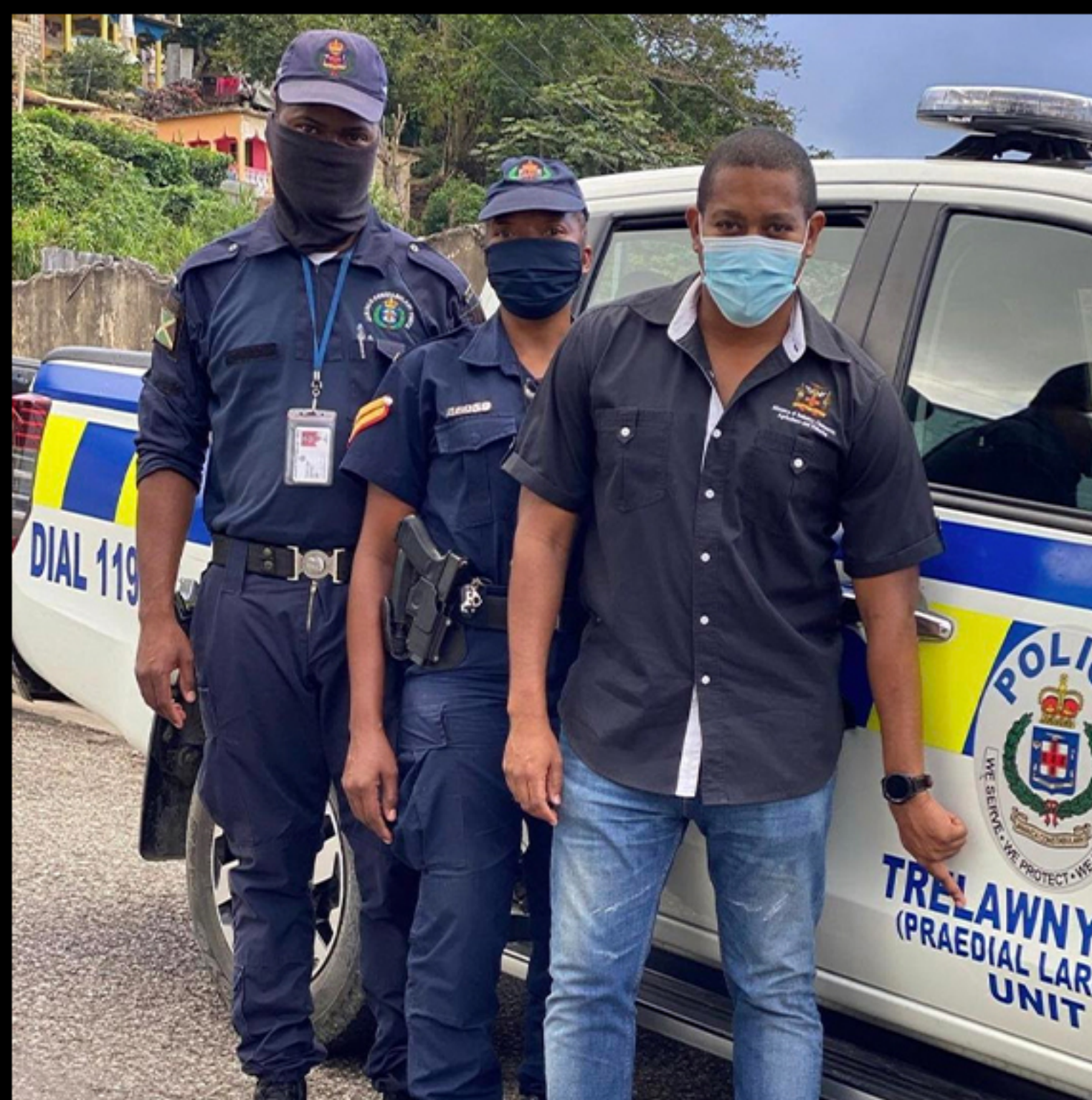
Minister Green with team members of the Praedial Larceny Unit in Trelawny.

Madam Speaker , we will not give up the fight against praedial larceny in this country and we encourage our farmers not to be deterred, but to work with the police through reporting of the incidences and collaborating at the community level with other farmers as we all work towards a praedial-larceny-free agricultural sector.