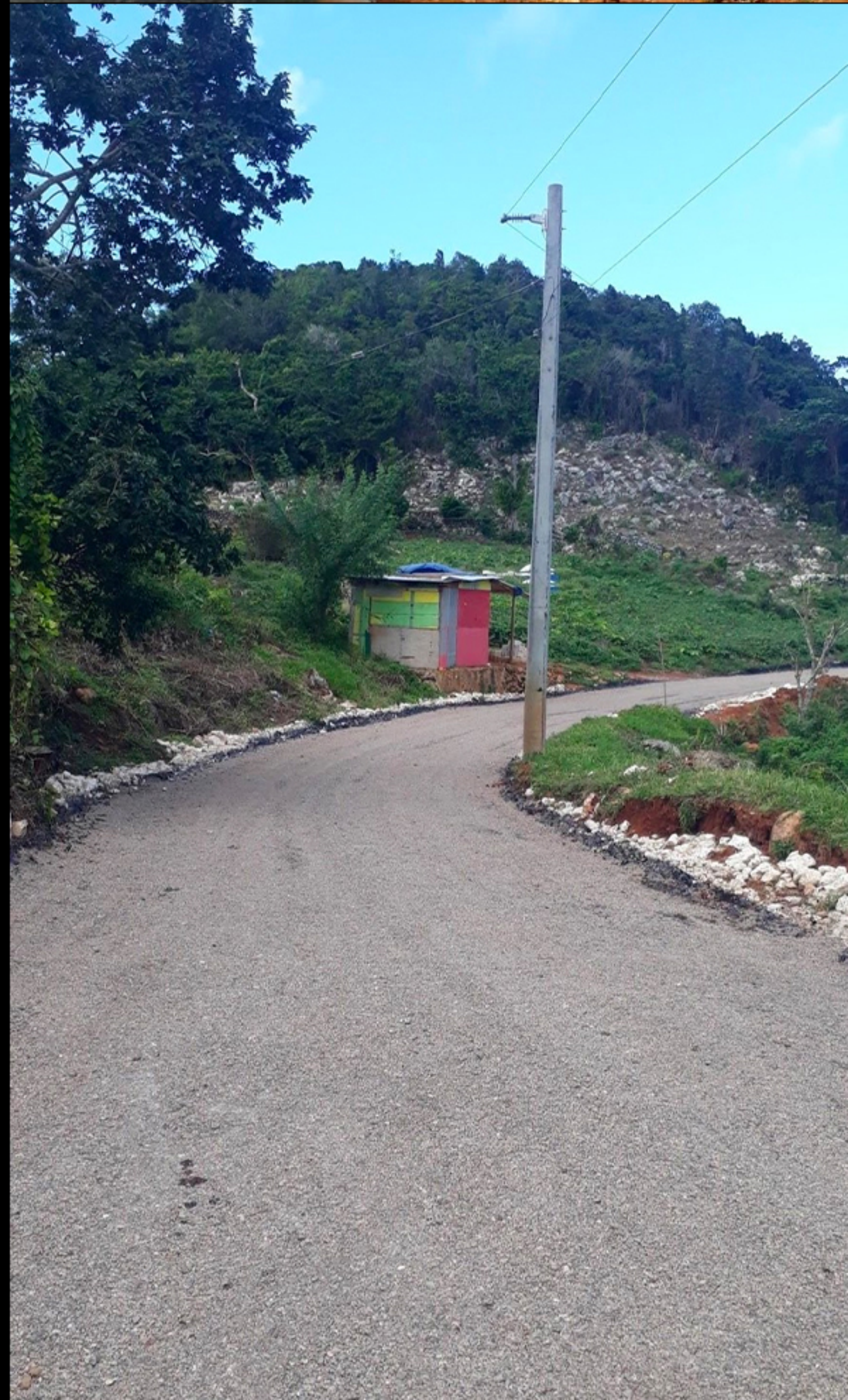
Farm road at Kimma in St. Ann, before and after.