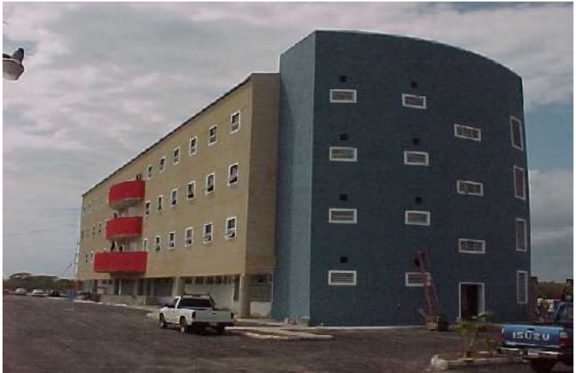
Naggo Head - Information, Communication and Technology Centre