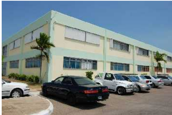
Portmore Informatics Park 50,000 sq. ft. building