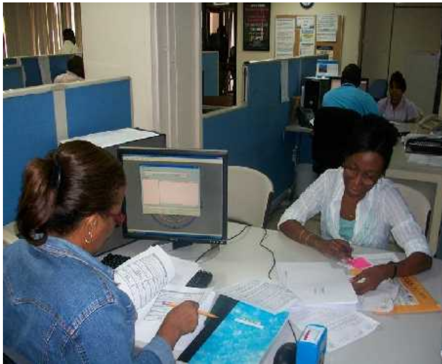
Business Registration personnel examining documents