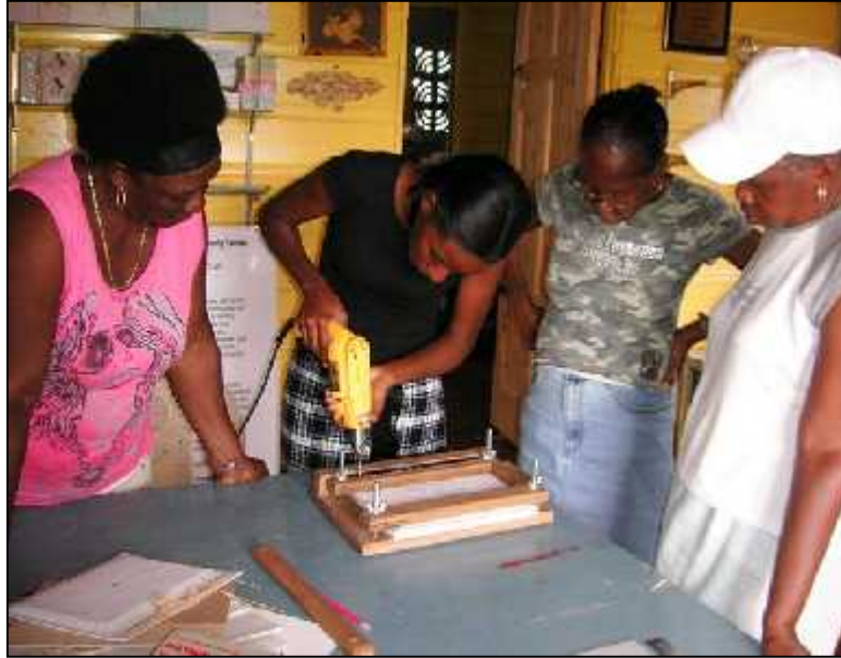
Productive Integration of Microenterprises in Jamaica (PIMJ) Project JBDC Product Development Officer demonstrating techniques to participants