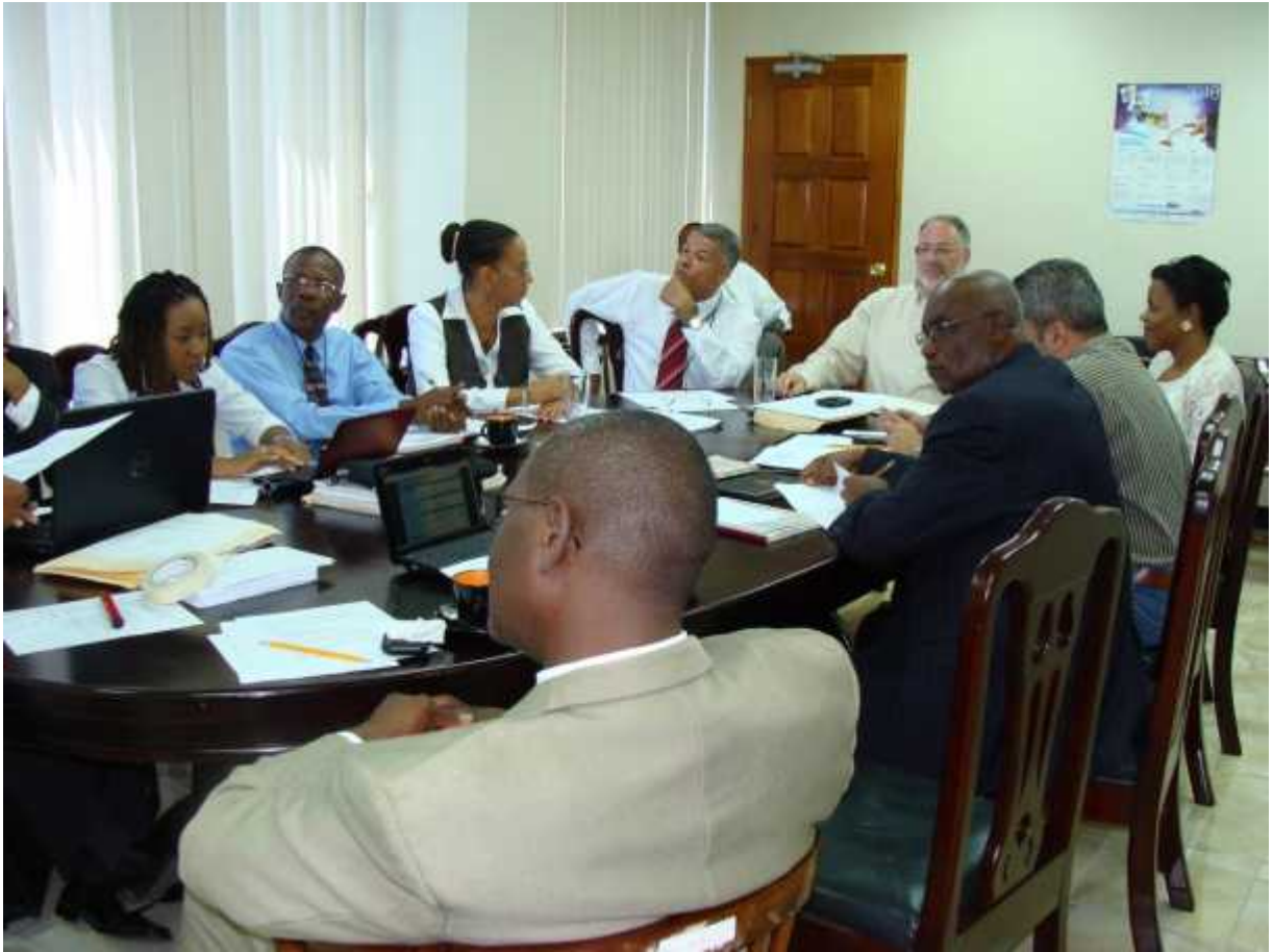
Trade Board Directors and Senior Management during the Board's Strategic Retreat