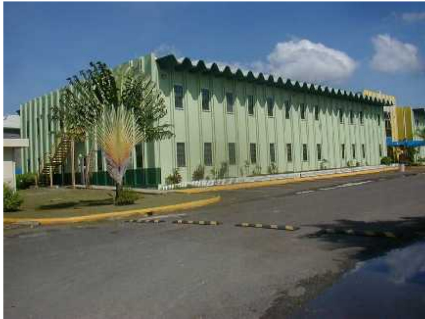
(6) Newly refurbished DEB 4 Building