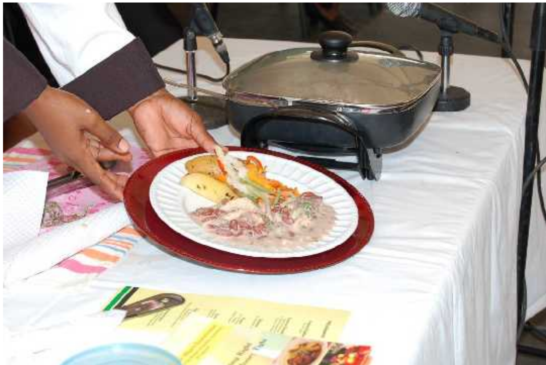
When Money tight' to a student at a Jamaica Cultural Development Commission event Launch of Nutritional Guide – July 2009