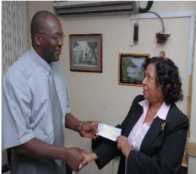
Client receiving loan disbursement cheque from General Manager