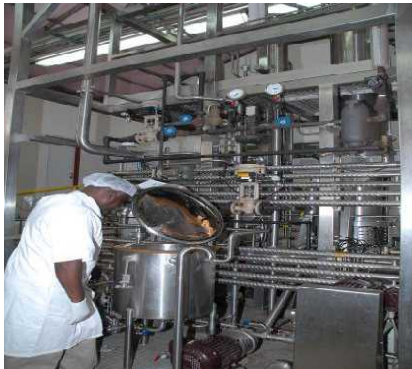
Spinning Cone Column at work