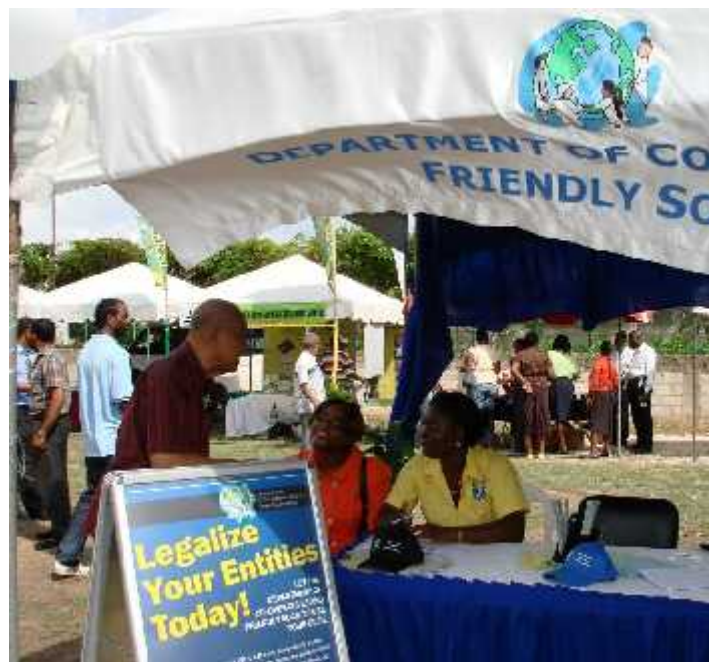
NUCS Expo October 2009