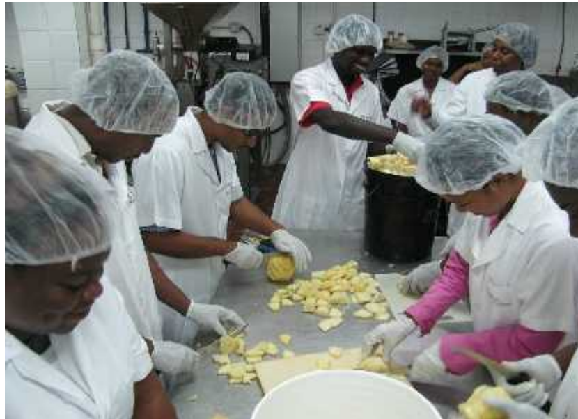
Participants at Natural Juice Processing Workshop held February 2010 in the Food Pilot Plant SRC, preparing pineapple juice as part of practicum