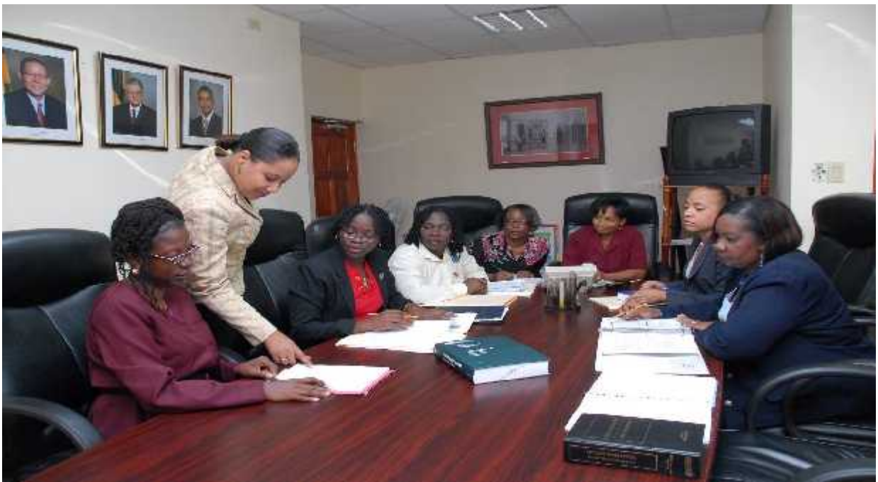
ADSC Senior Legal Council demonstrate her point to Executive Director in Staff Meeting