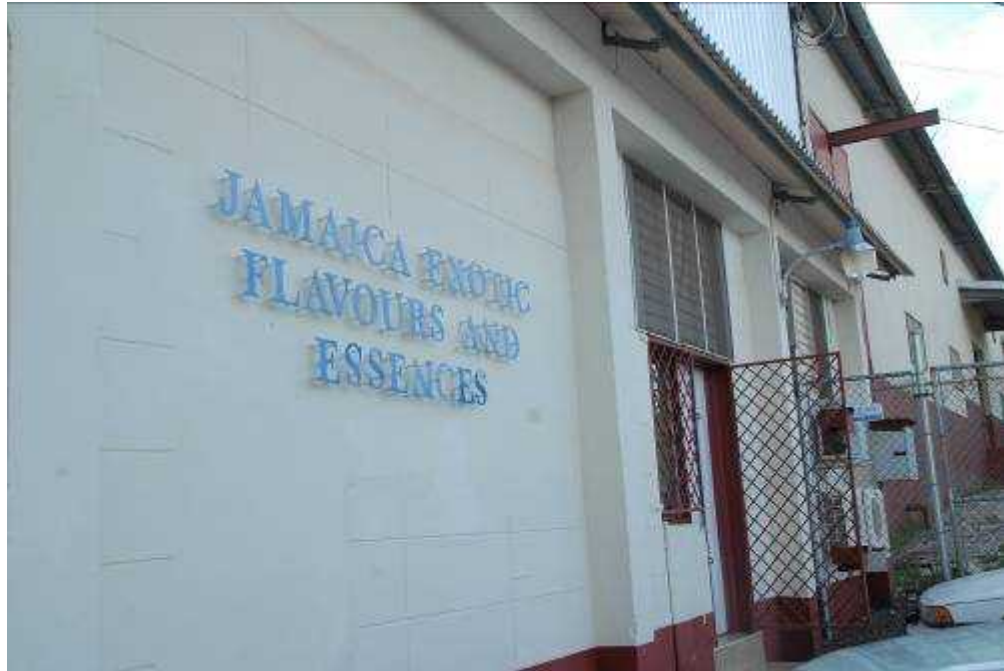
JEFE's Office in Bull Savannah, Westmoreland