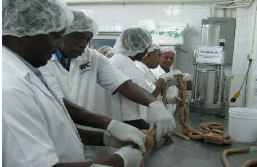
Participants at Meat Processing Workshop held October 2009 in the Food Pilot Plant SRC, preparing jerk sausage as part of practicum.