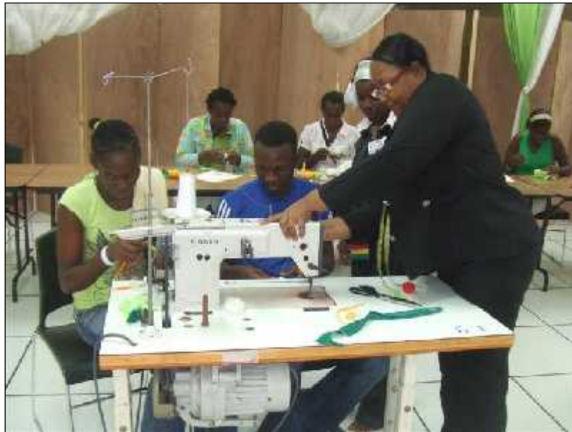
Soft Toys Training at JBDC's Incubator and Resource Centre