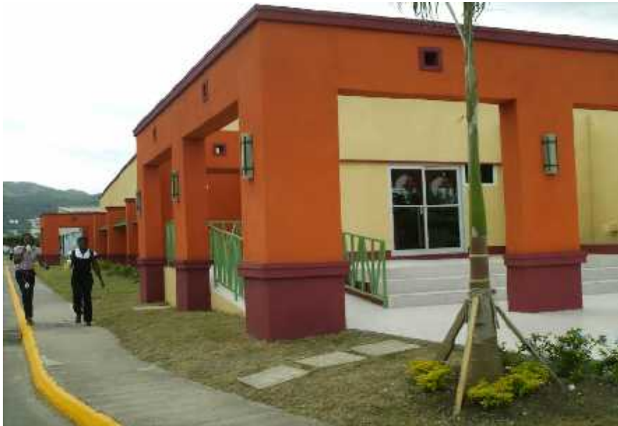
Factory No. 8 – Allianceone