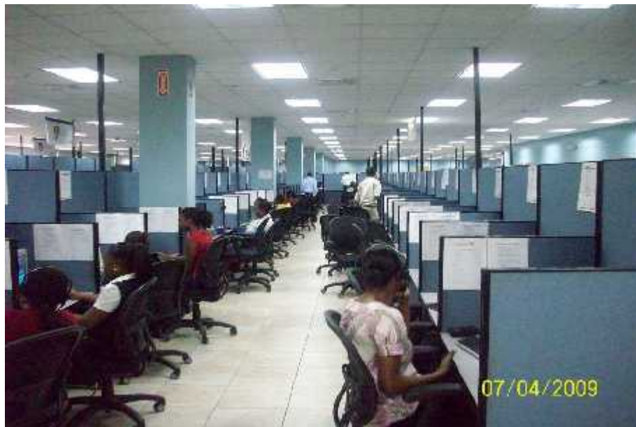
Employees at work in a newly converted ICT space