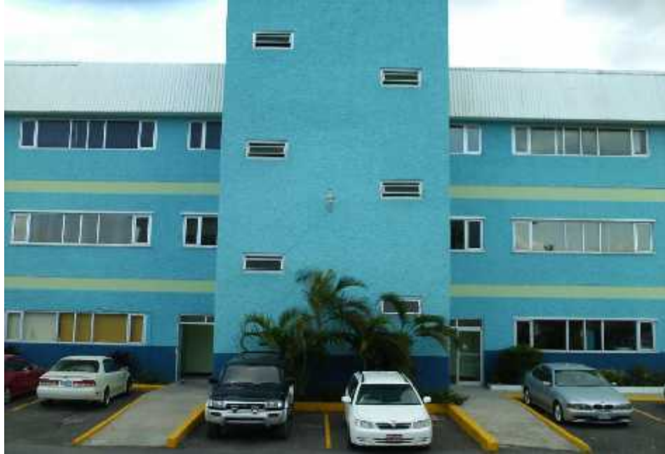
(5) Newly refurbished DEB 2 Building