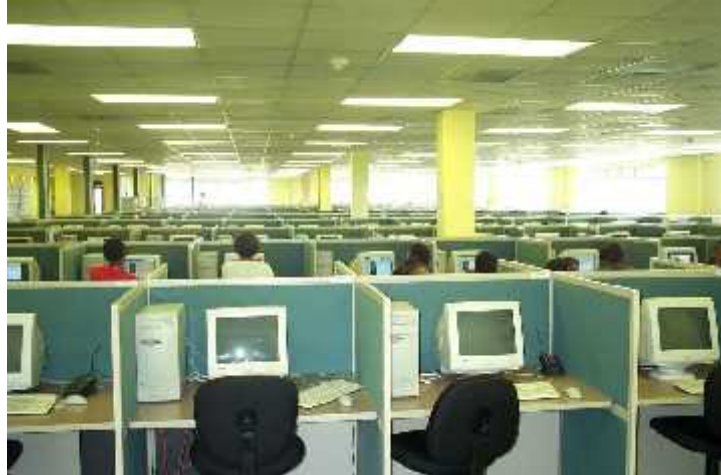
Portmore Informatics Park call centre