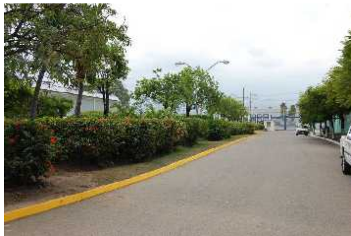
Landscaped roadway on the KFZ