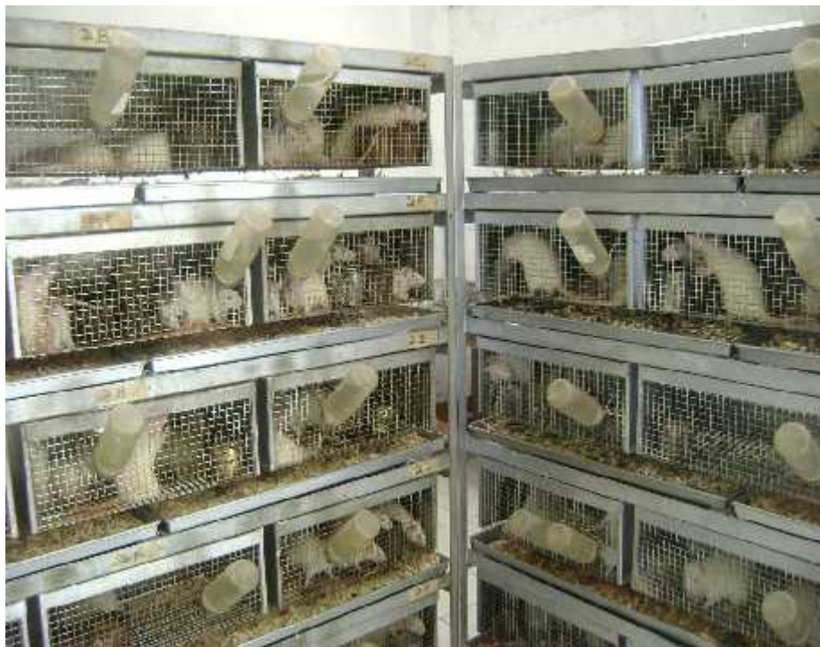
Rodents reared in FSPID Laboratory for testing efficacy of rodenticides.