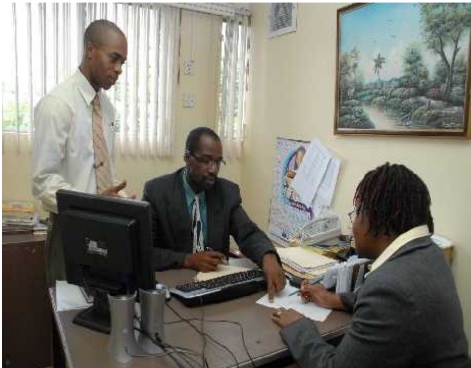
Credit Officers directing client in signing an application