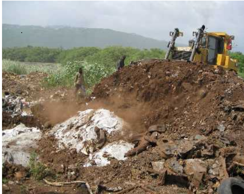
Food Storage Inspector overseeing the destruction and burial of rice