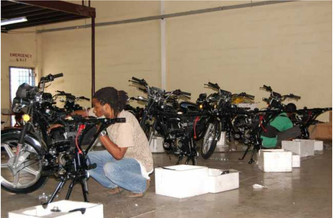
Motorbikes being assembled for export from the KFZ