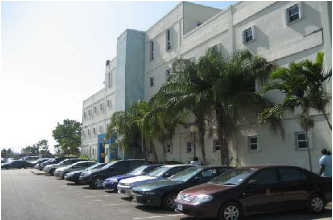
Montego Bay Freeport