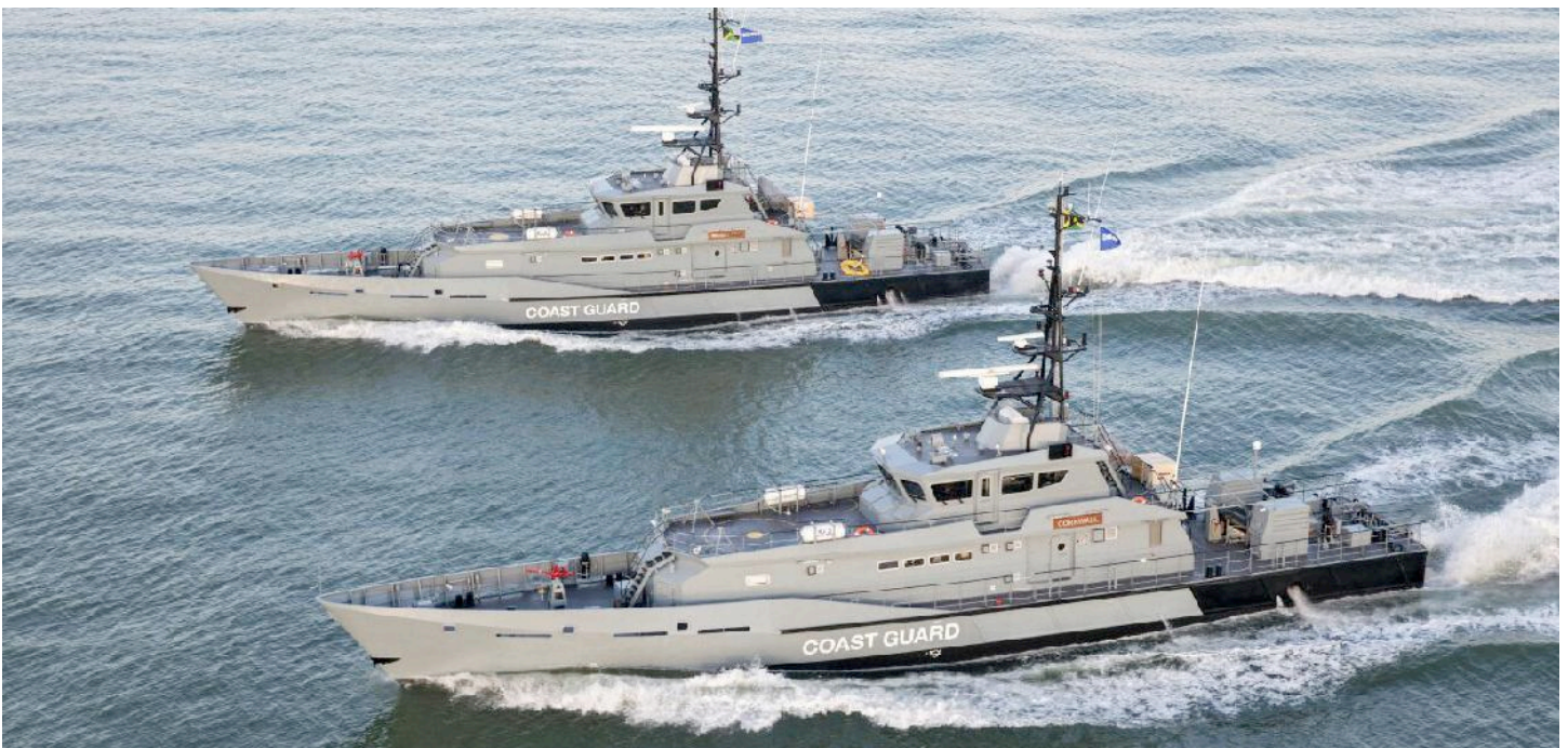
Patrol vessels at sea

Mr. Speaker, it is not insignificant that the new Fisheries Bill is coming at a time when the Government has bolstered its capacity to monitor our waters through the acquisition of two offshore patrol vessels by the Jamaica Defence Force.