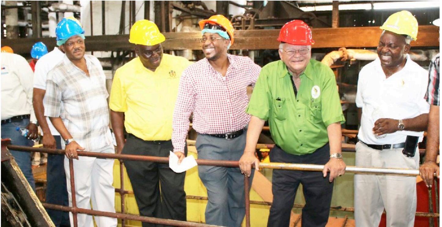
Touring Long Pond

When I came to office, Mr. Speaker , although all Government estates were divested, we faced a major crisis in relation to two of those estates, namely Long Pond and Monymusk.