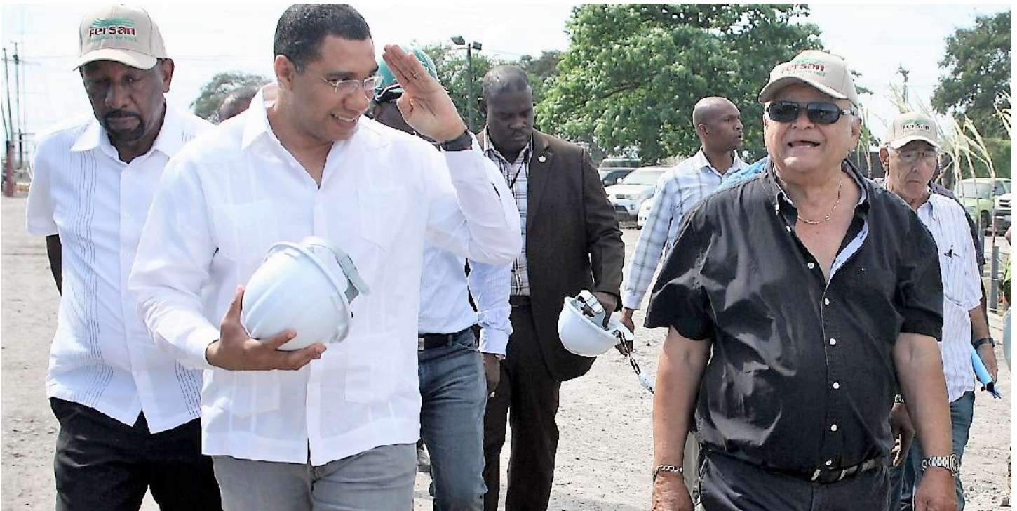
Touring Monymusk with Most Honourable Prime Minister, Andrew Holness

Significantly, we have been working with both Everglades Farm Ltd. and other private investors with a view to secure some investments in co-generation and ethanol production. Unfortunately, these discussions have not reached the point to allow for the opening of that factory for the current 2016/2017 crop. However, with Appleton back in operation this year, the Government has provided a $51m transport subsidy to assist with the movement of the cane from the Long Pond area to Appleton. This is now proceeding apace.