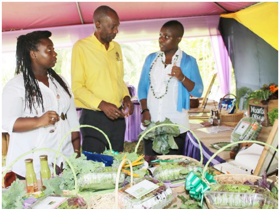
Minister J.C. Hutchinson discusses organic produce with members of the Jamaica Organic Agriculture Movement.