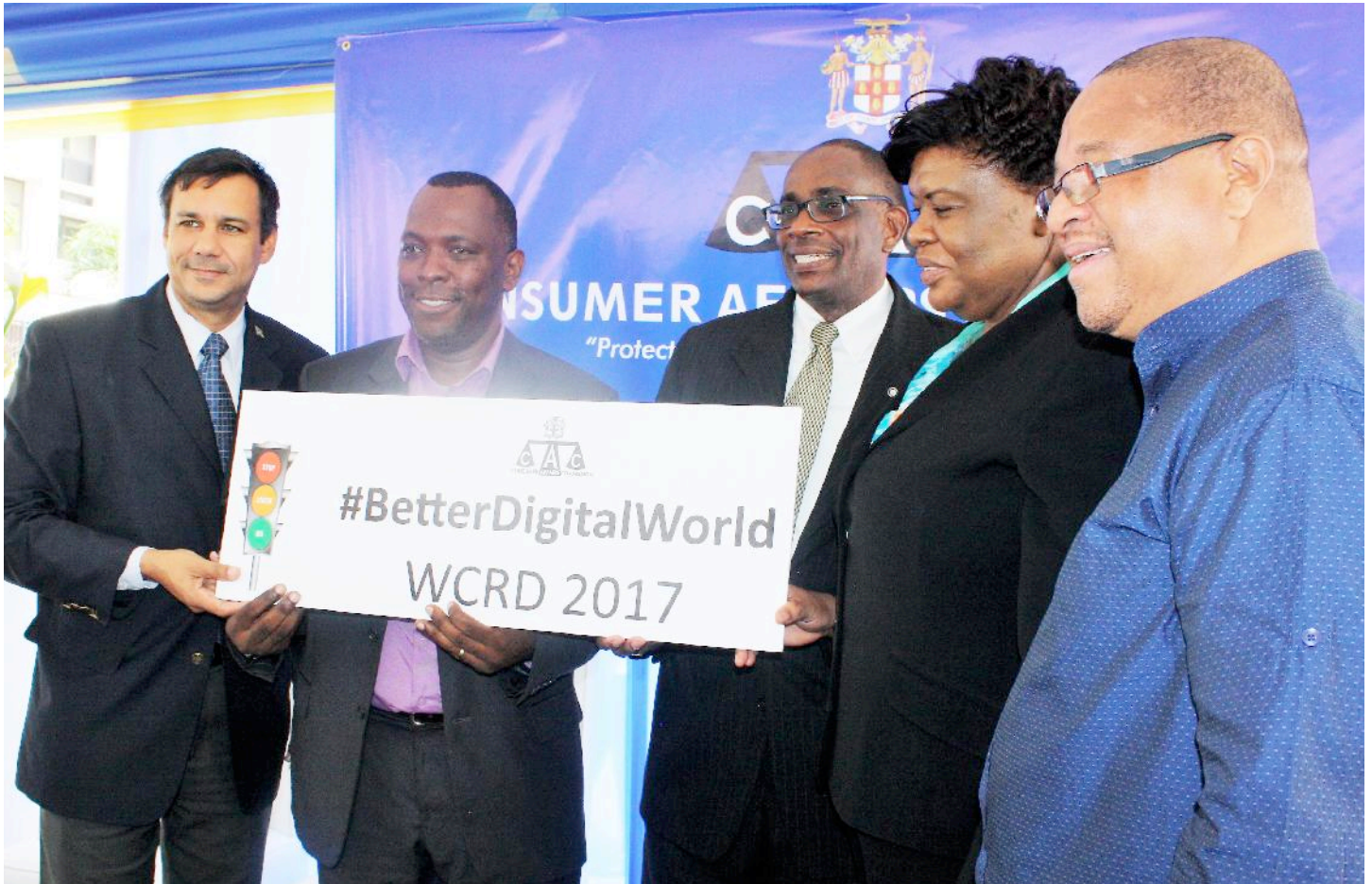
World Consumer Rights Day 2017

In all that we do, Mr. Speaker , a major priority of the Ministry will continue to be the protection of the rights of the Jamaican consumers and so we will endeavor to pursue and promote best practices and international standards for food and nutrition safety, Good Agricultural Practices and Good Manufacturing Practices.