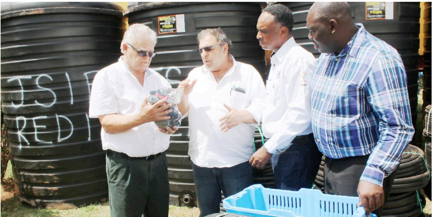
Discussing irrigation at New Forrest Duff House Agro Park

Therefore, if we are serious about increasing agricultural productivity and production, we have to address, in a fundamental way, the issue of irrigation expansion. This is what will make a qualitative difference to agriculture in Jamaica and help us to move from sporadic growth depending on rainfall to a constantly increasing trend of growth.