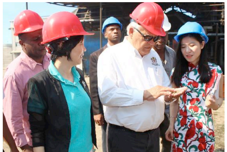
At Frome Factory

Mr. Speaker, all the above initiatives under the Sugar Transformation Programme were necessary but not sufficient. It was urgent that the Government addressed long-standing social issues, which were neglected over time. However, the question of the viability of the sugar industry itself and how to improve efficiency and productivity therein, still loom large.