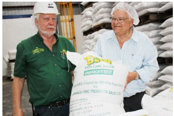
Bagged sugar at Worthy Park

Sugar has the potential to be viable and profitable. In this regard, Mr. Speaker, we have to pay attention to the following strategies: