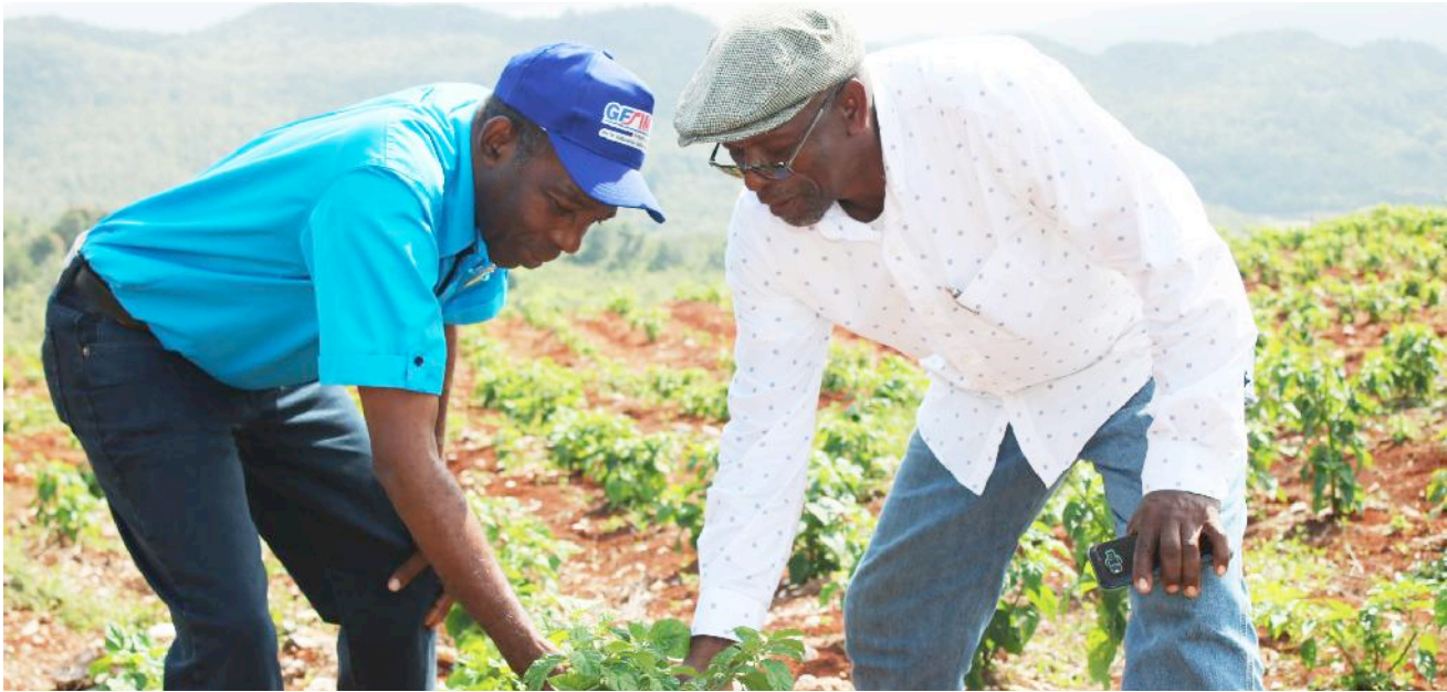
Discussing good agricultural practices for peppers.

We are acutely aware that this vision will only be realized through partnerships. While I have indicated the areas where private sector investment is important, I am also conscious that there are things that only Government can do to make this happen.