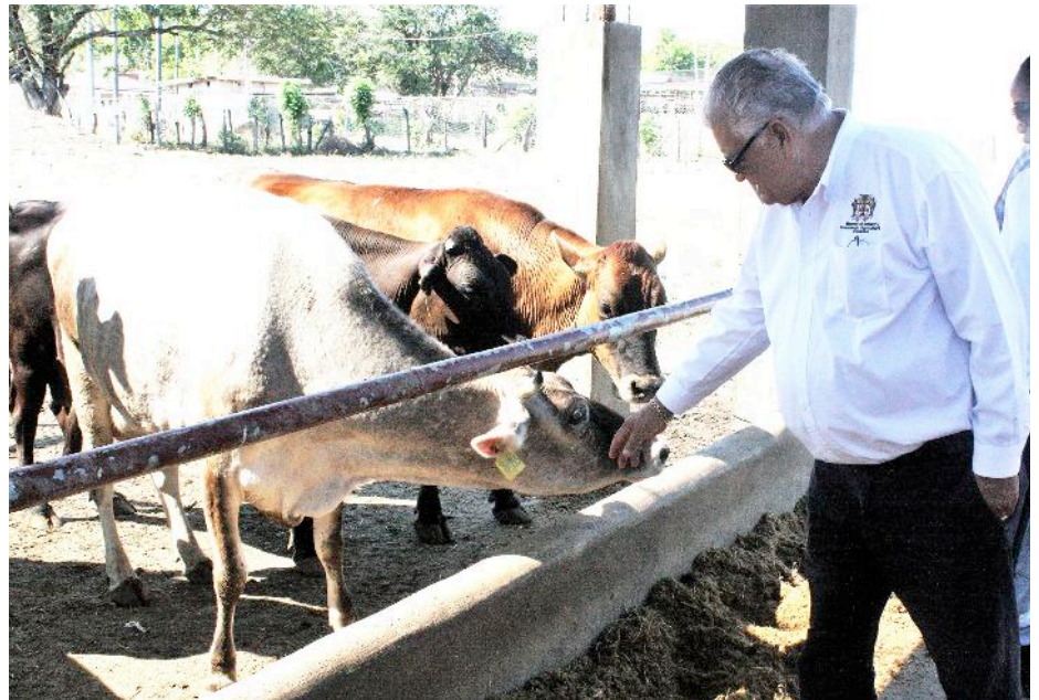
At Serge Island Diaries

Our commitment is to provide the enabling environment through judicious management of our import policy in relation to milk and milk products.