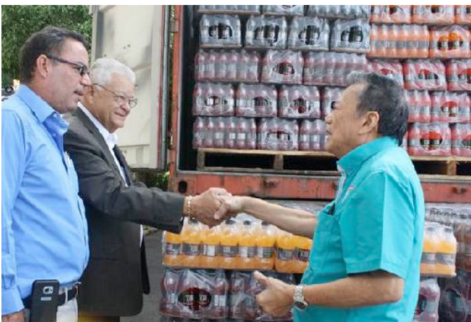
At Lasco Manufacturing

We also note the levels of investment of such manufacturers as Lasco and Seprod. These two companies alone are currently spending some $1.5b in the expansion of their businesses.